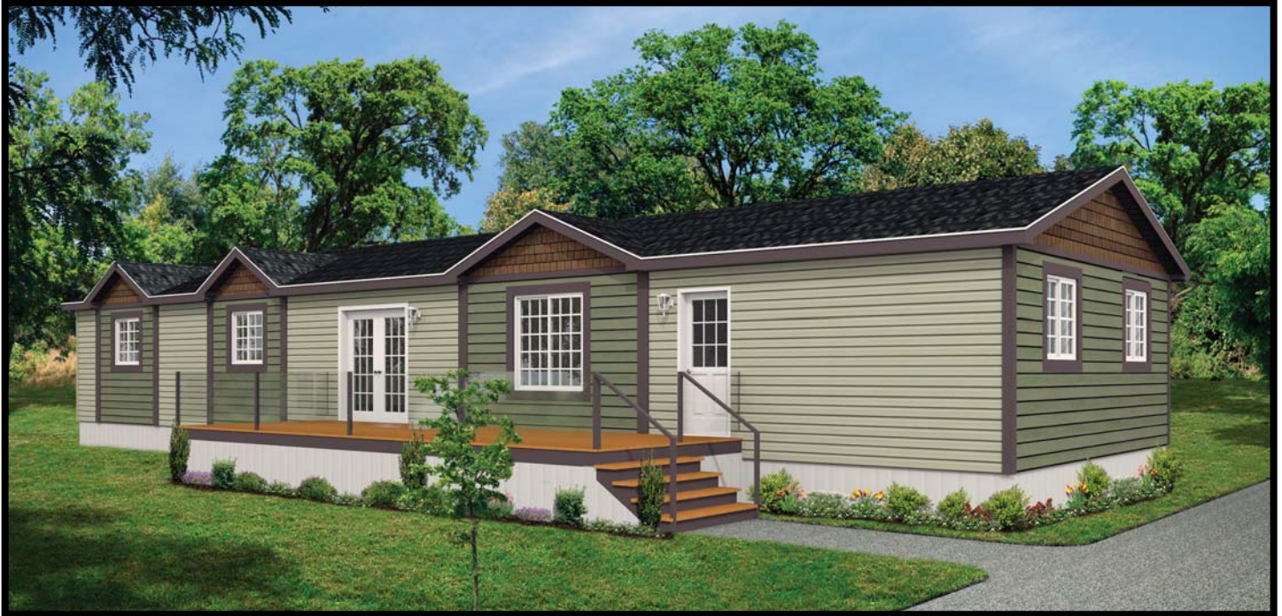
Some exterior features shown may be optional or done by others on site.