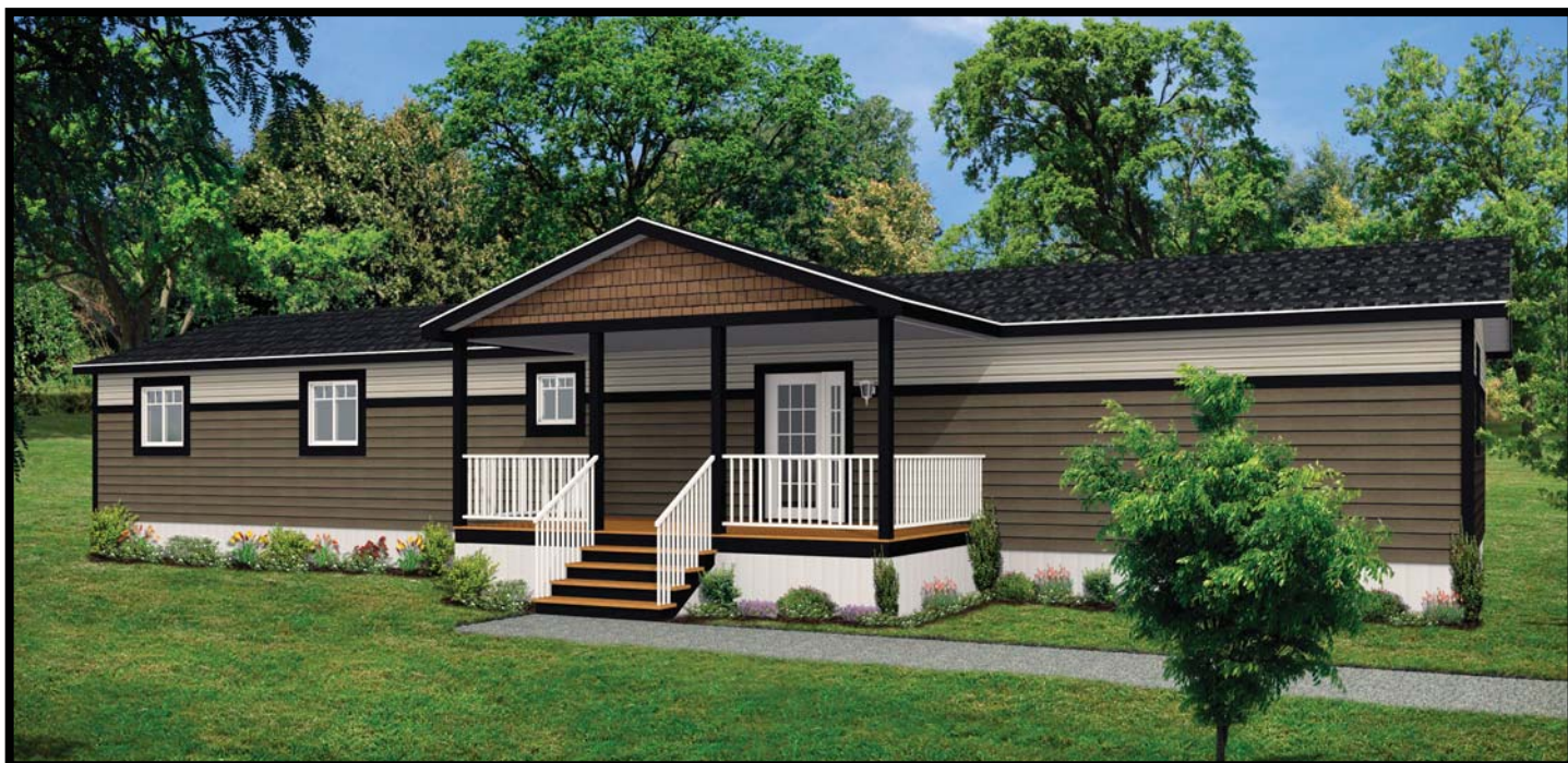
Some exterior features shown may be optional or done by others on site.