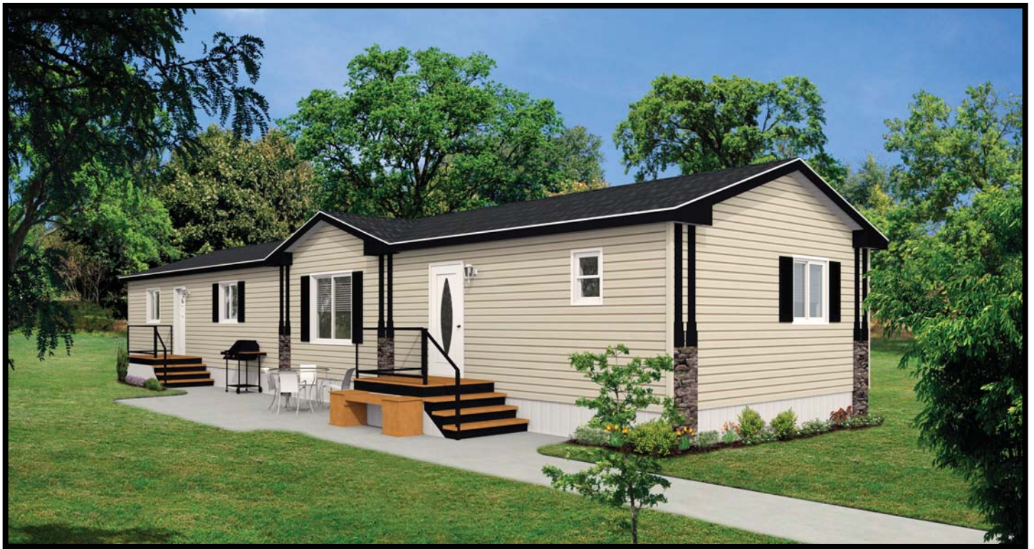
CJN 3000 20' x 76' 1,520 sq. ft.