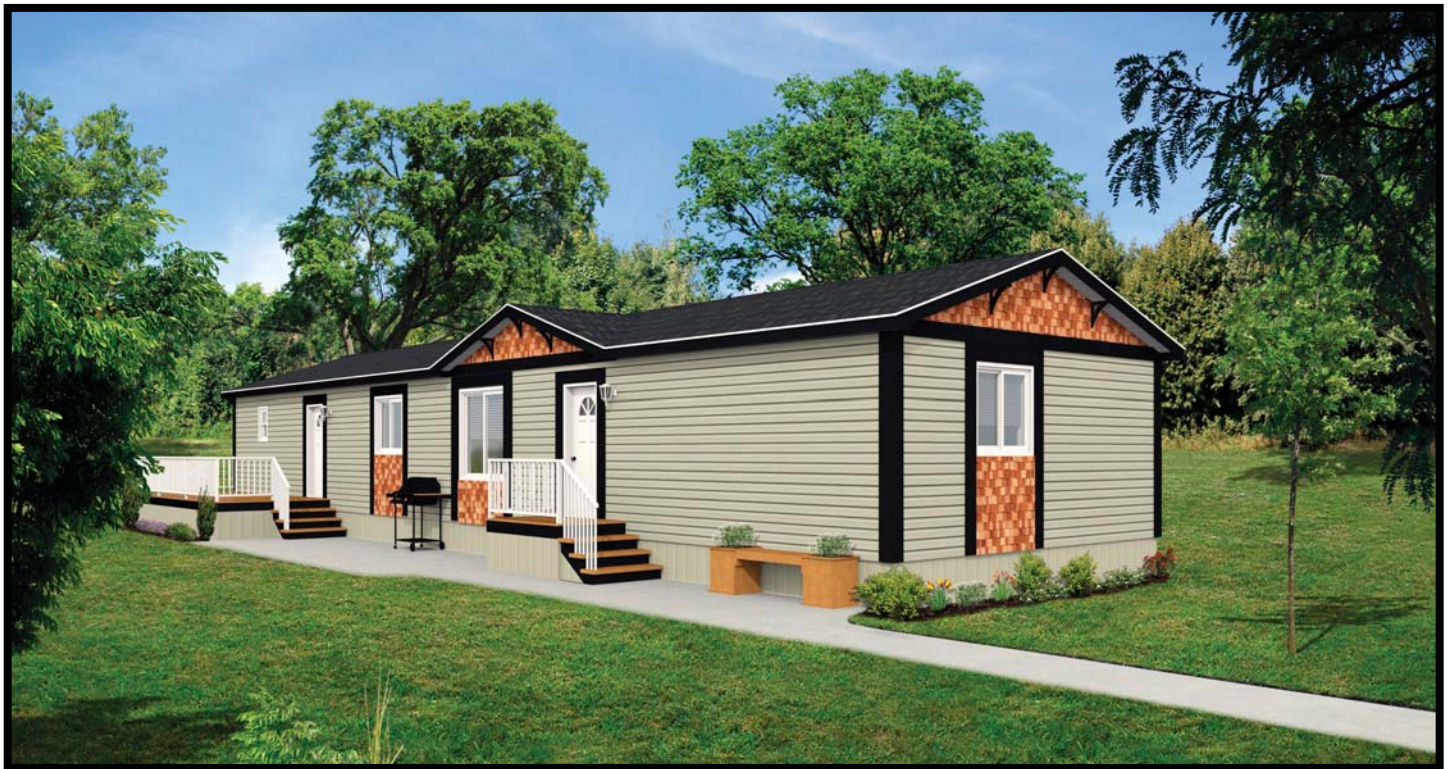
CJN 3004 20' x 72' 1,440 sq. ft.