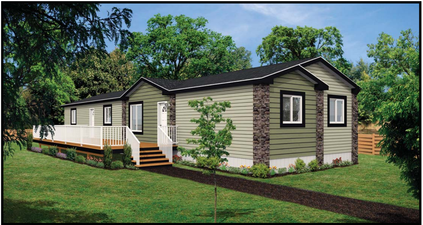
CJN 3005 20' x 76' 1,520 sq. ft.