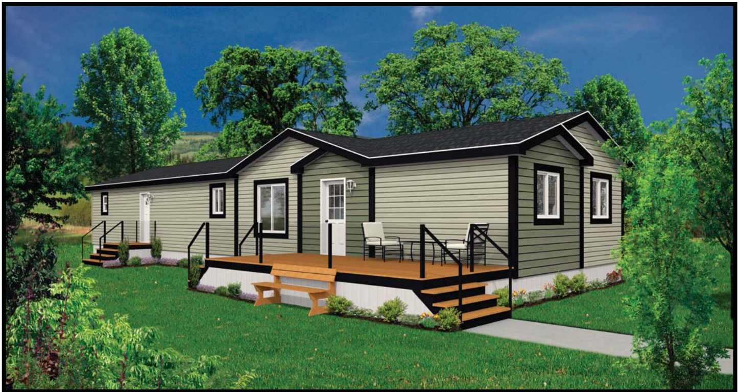
CJN 3018 20' x 76' 1,520 sq. ft.