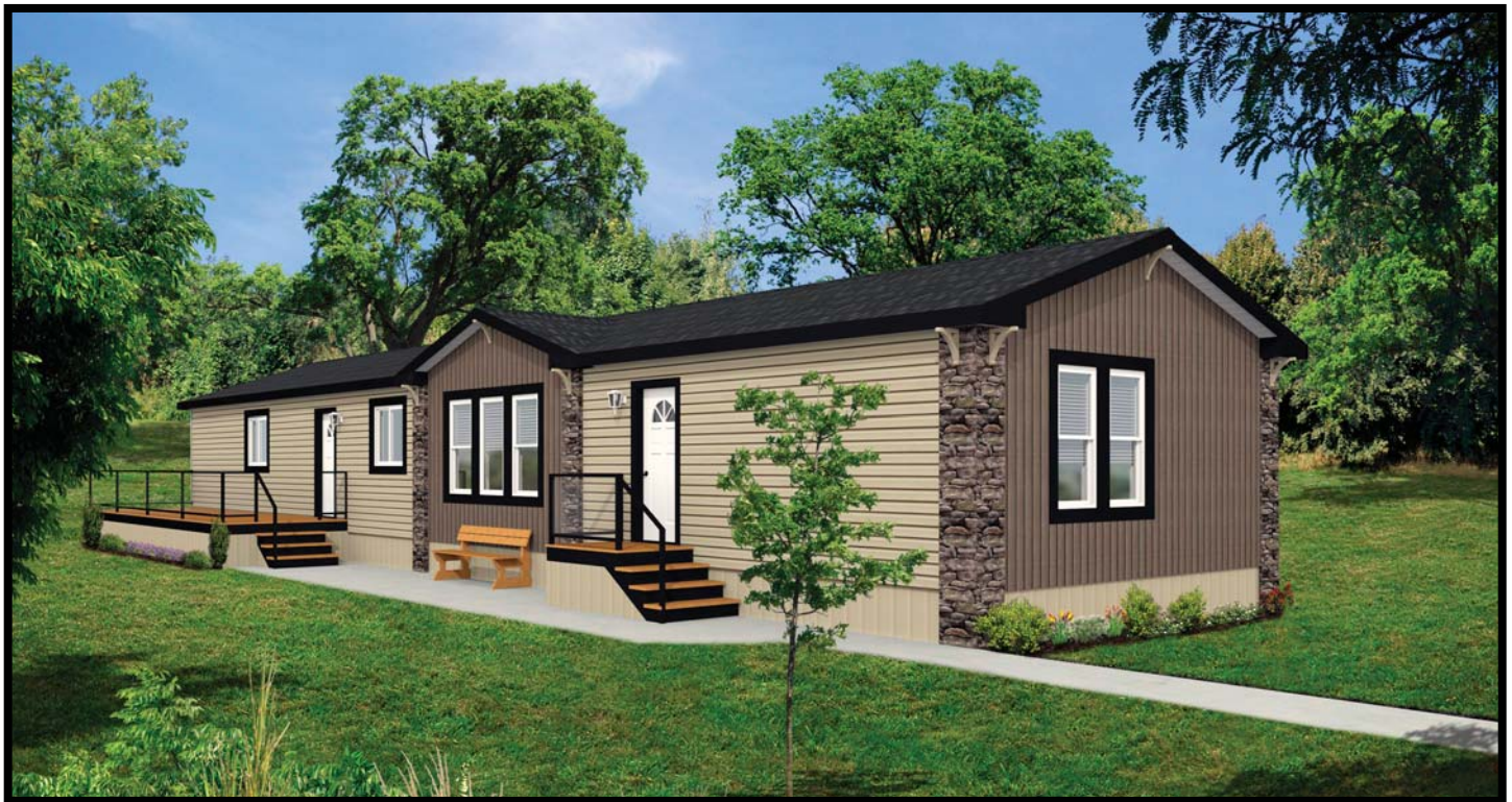
CJN 3019 20' x 76' 1,520 sq. ft.