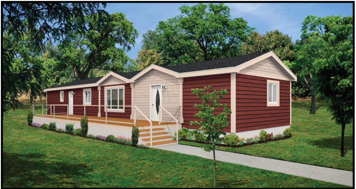
CJN 3021 20' x 76' 1,520 sq. ft.