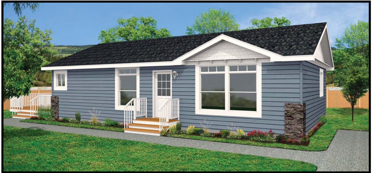
NS-101a • 26'x 44' • 1,144 sq. ft.