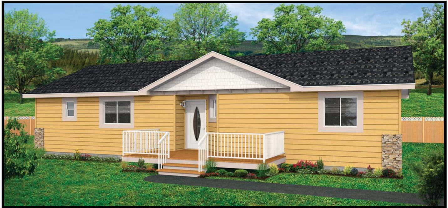
NS-717a • 27'-6" x 54' • 1,485 sq. ft.