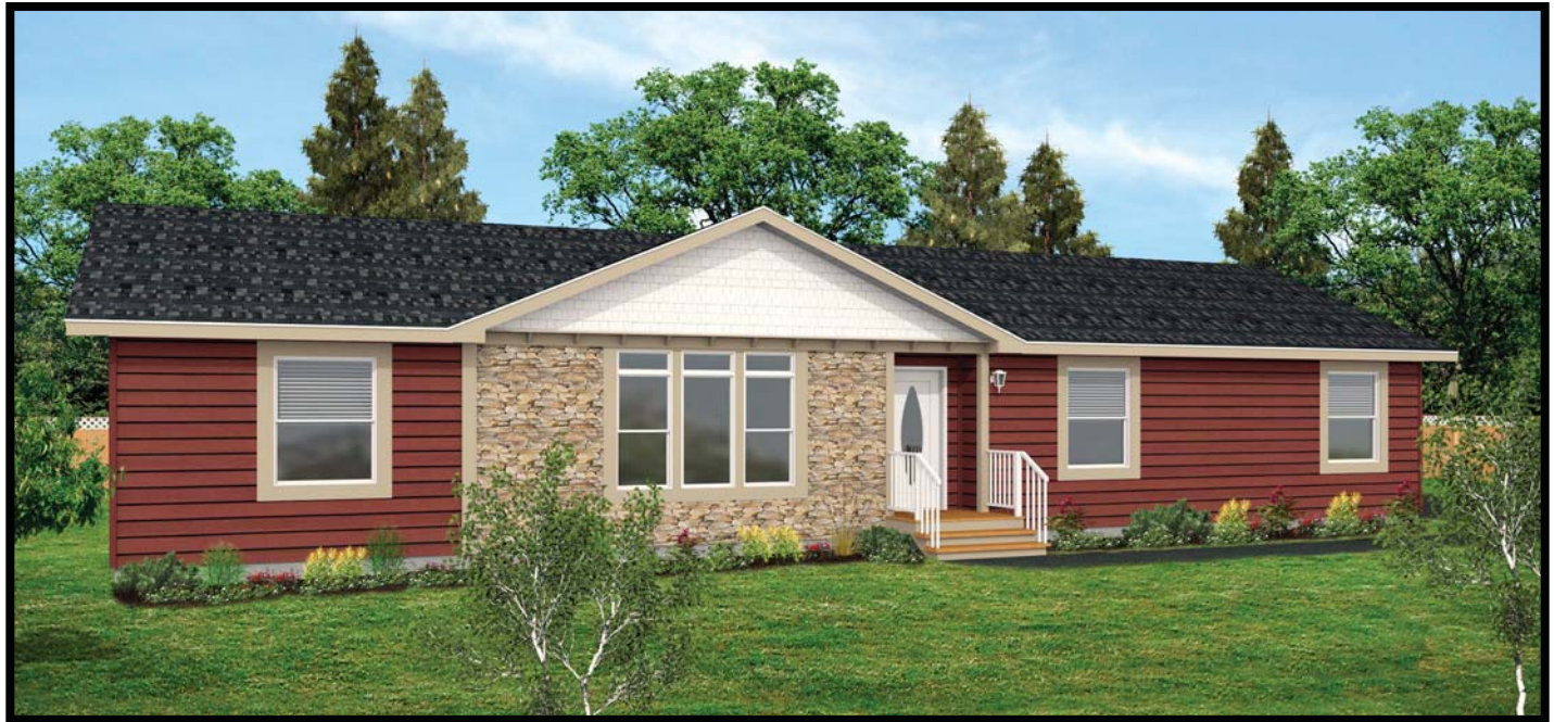
NS-729a • 27'-6" x 66' • 1,815 sq. ft.