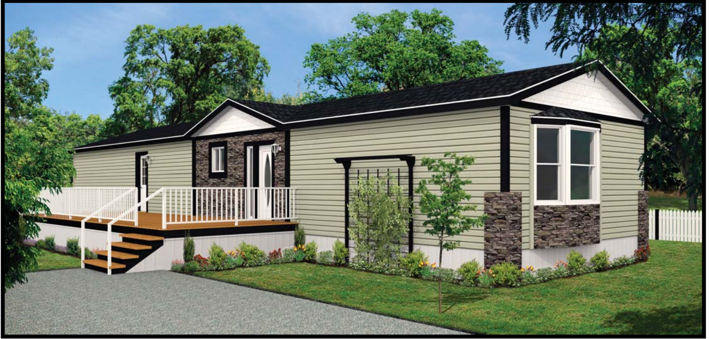
N-2003, "The Orion", 20' x 76', 1,520 sq. ft.