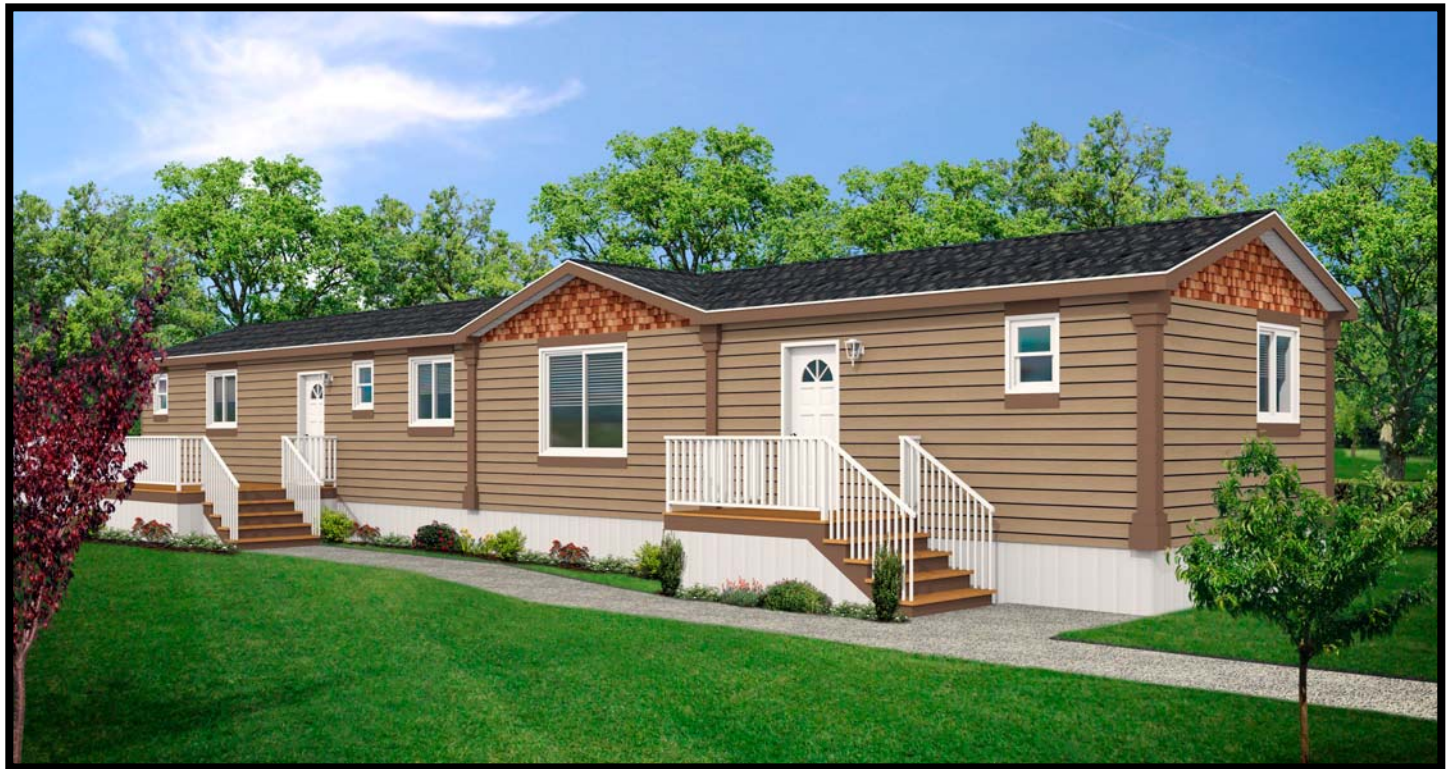
NP-913A 16' x 76' 1,216 sq. ft.