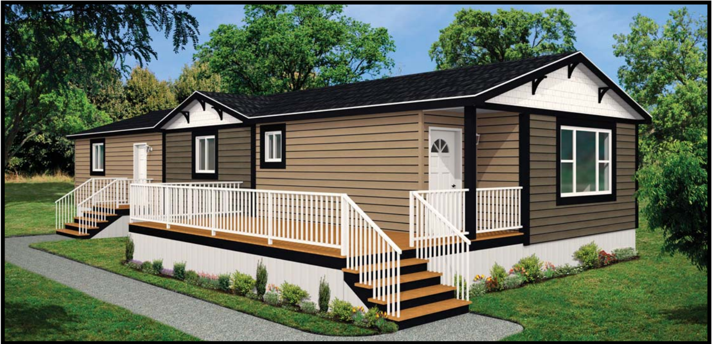
Some exterior features shown may be optional or done by others on site.