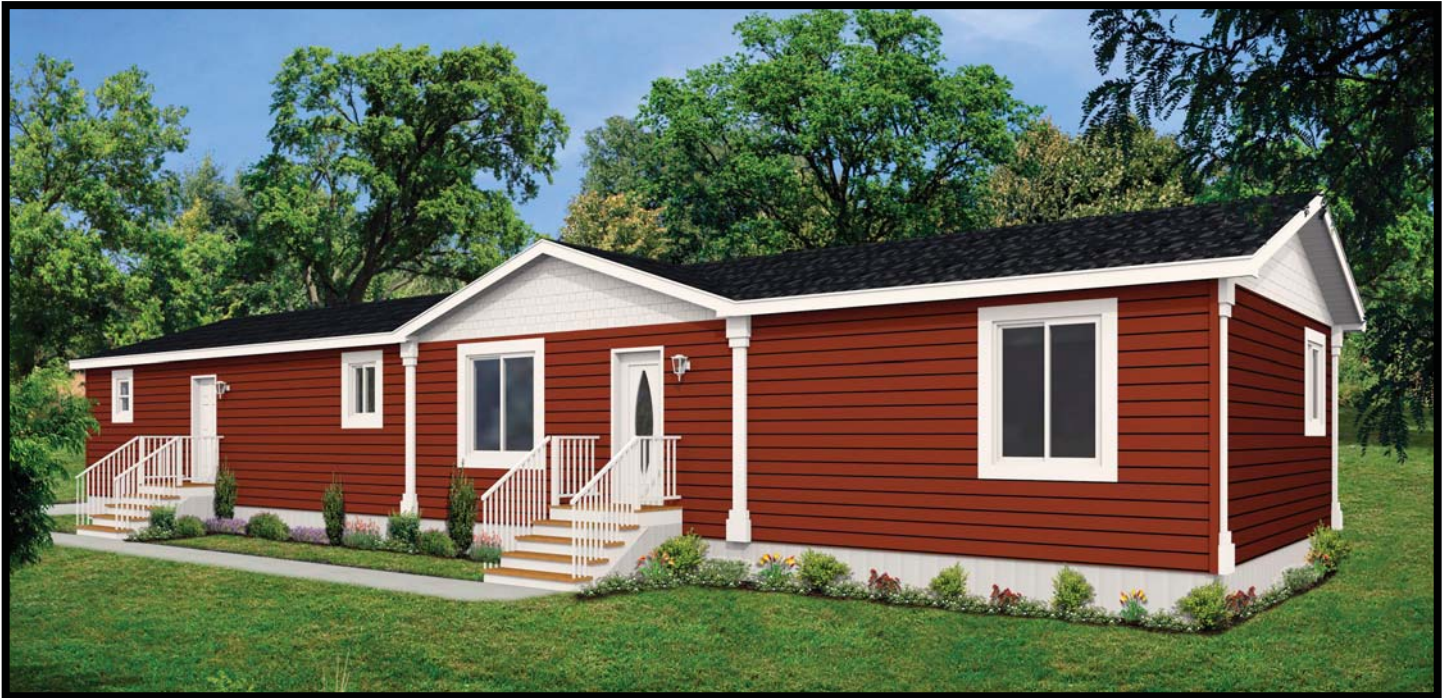
Some exterior features shown may be optional or done by others on site.