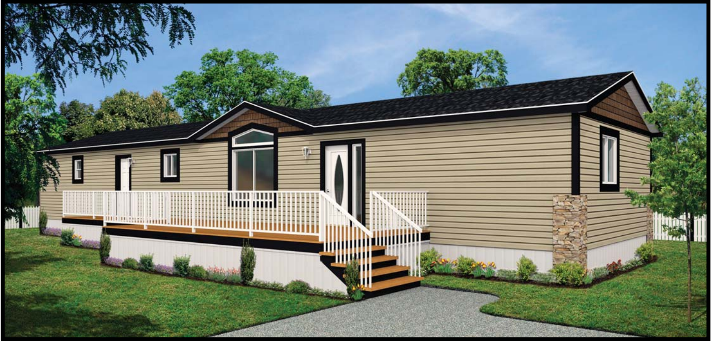
N-2005, "The Sextans", 20' x 76', 1,520 sq. ft.