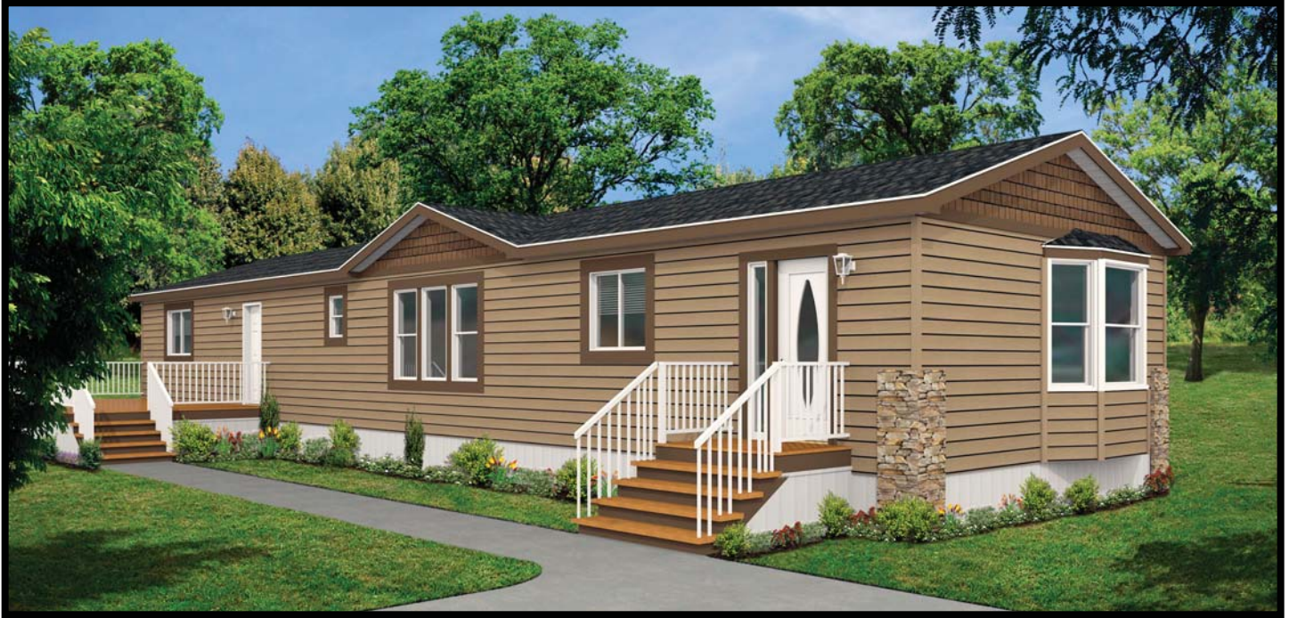
N-2009, "The Phoenix", 20' x 76', 1,520 sq. ft.