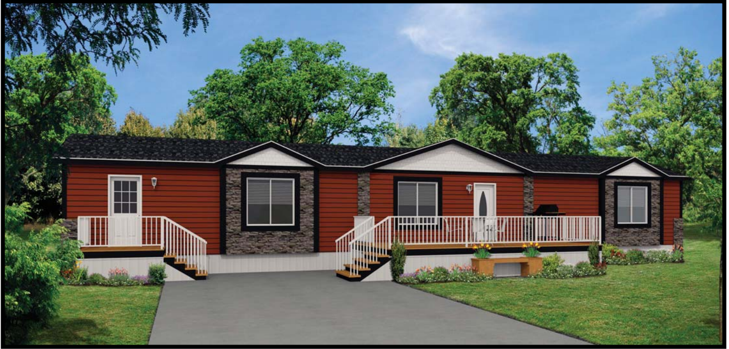
N-2011, "The Virgo", 20' x 76', 1,520 sq. ft.